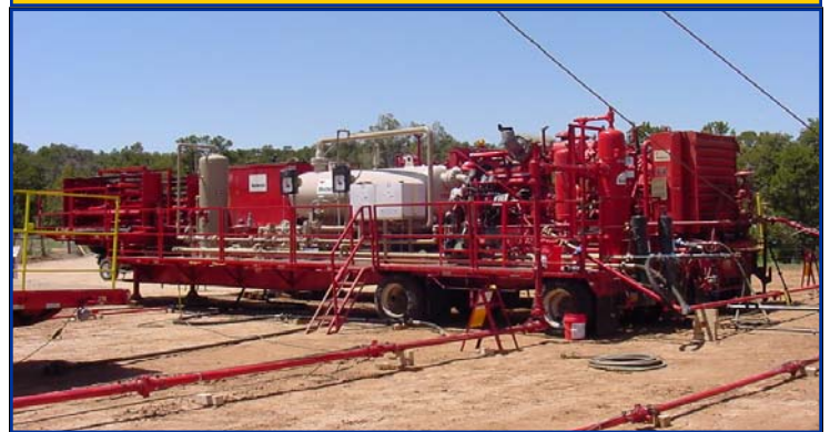
Exhibit 3: Truck Mounted Reduced Emissions Completion Equipment

2) Boost to Sales Line. When the gas recovered in the REC separator is lower pressure than the sales line, some companies are experimenting with a compressor to boost flowback gas into the sales line. This technique is experimental because of the difficulty operating a compressor on widely fluctuating flowback rate. Coal bed methane well completion is an example where additional compression might be required.